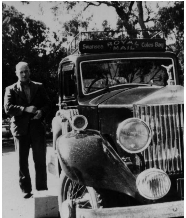
The Rolls Royce with its Royal Mail sign.