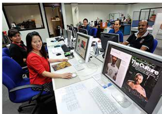
Everbest Hong Kong - behind the scenes