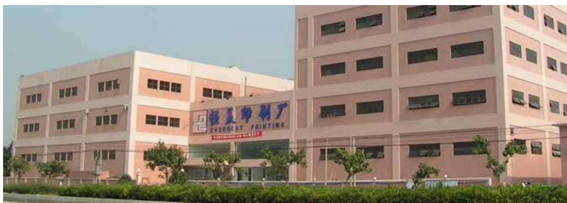
Everbest Chinese headquarters