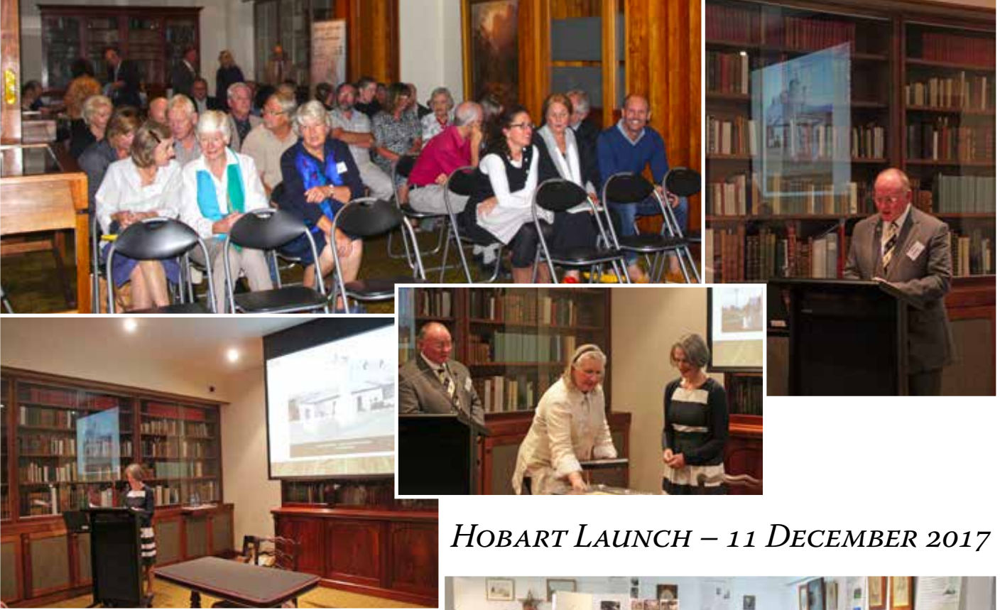
HOBART LAUNCH – 11 DECEMBER 2017