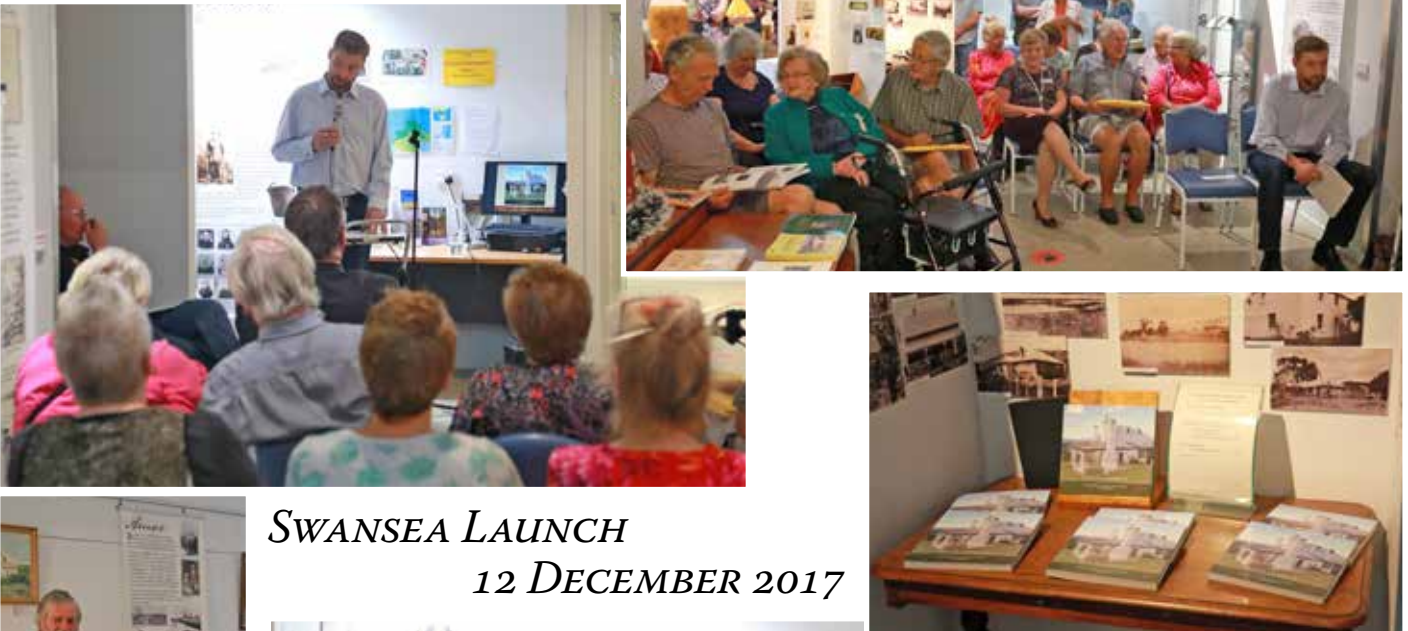
SWANSEA LAUNCH 12 DECEMBER 2017