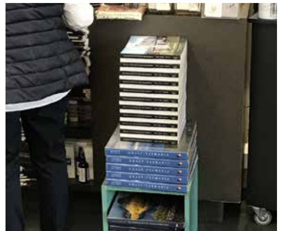
A stack of Houses & Estates books at Fullers, ready for Christmas sales