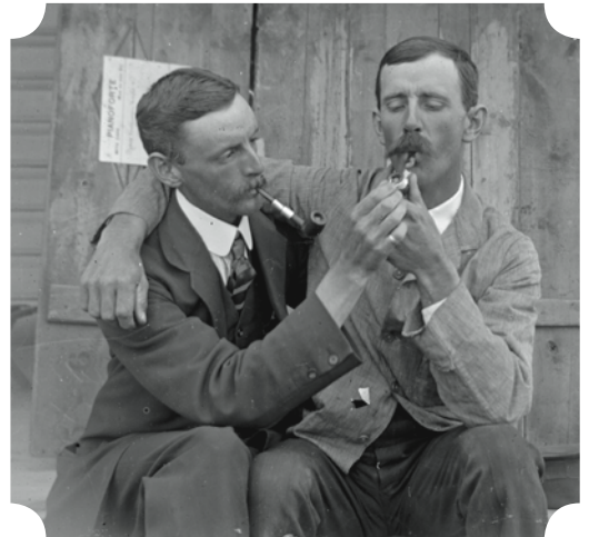
Light a smoke for your mate (in your Sunday best)