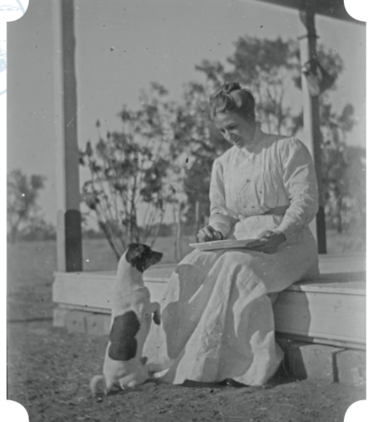
Treats for a pet