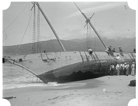
An outing to see the Mary Burgess shipwreck on Wineglass Bay