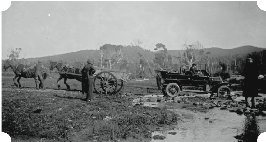
Hard yakka if you get bogged!