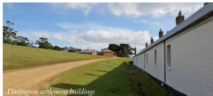
Darlington settlement buildings