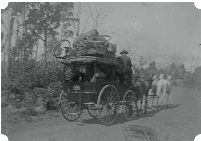
Catching the coach to Hobart (it would have been a bumpy ride)