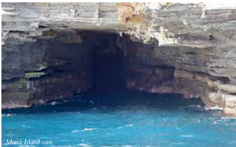
Maria Island cave