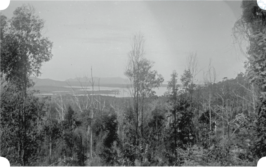
View from Cherry Tree Hill