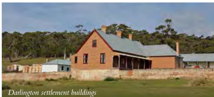
Darlington settlement buildings