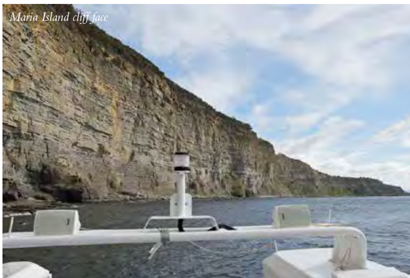
Maria Island cliff face